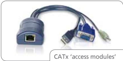
CATx 'access modules' allow you to connect any type of computer to the switch